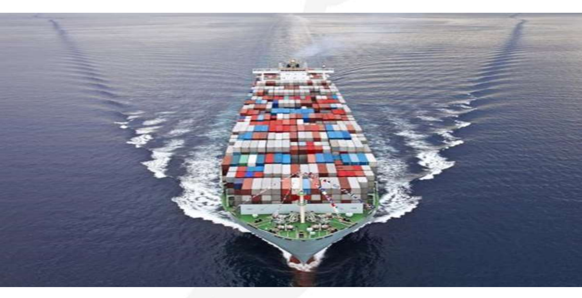
Time to steam ahead